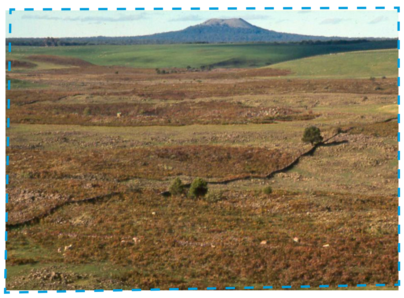
Harman's Valley Lava Flow