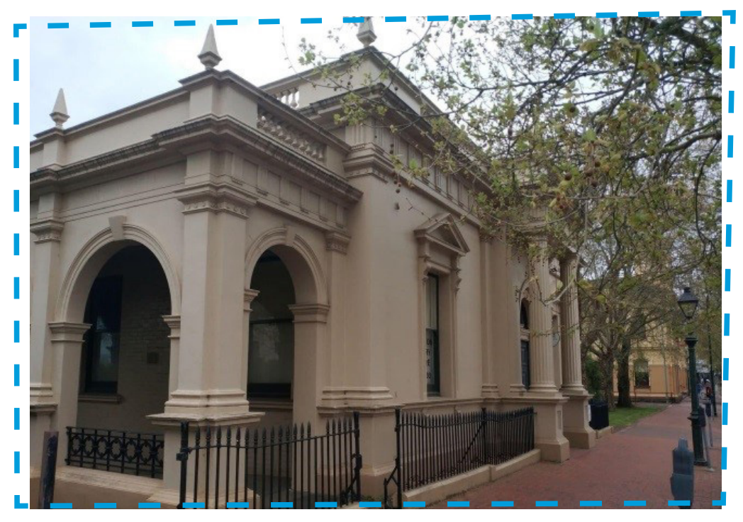
Hamilton History Centre

The Heritage Advisor and Planning Officers are well placed to assist asset managers in managing heritage places and supporting positive conservation outcomes, through policy development, heritage advice and identifying funding opportunities.