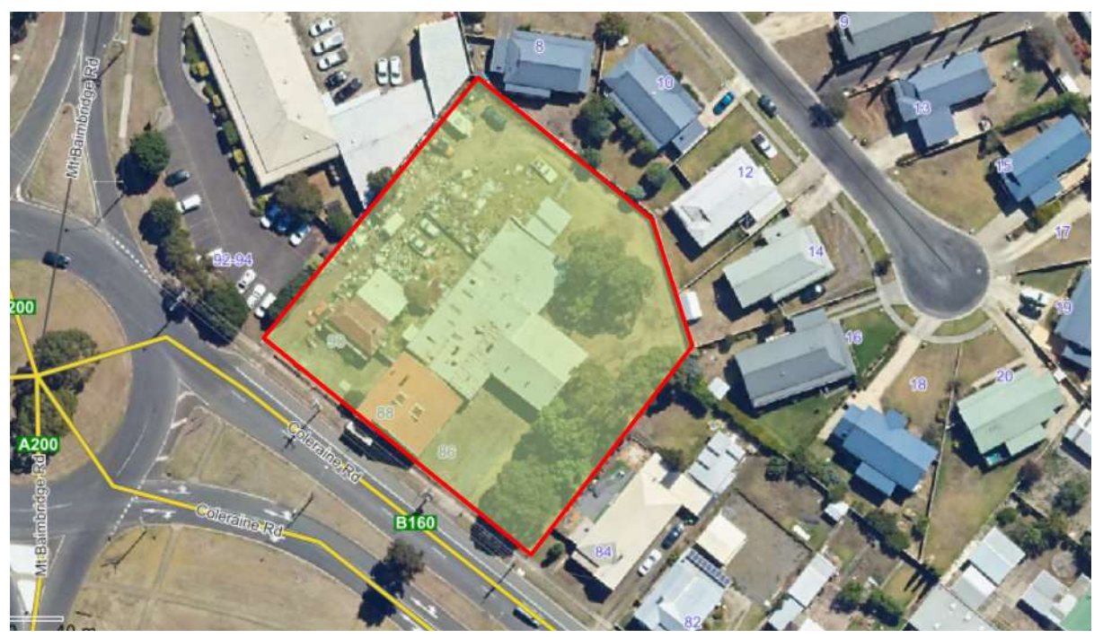
Figure 4 above. Subject site highlighted in red.