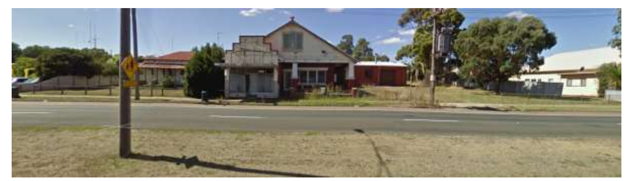
Figure 2 above. Google street view of the frontage of all sites