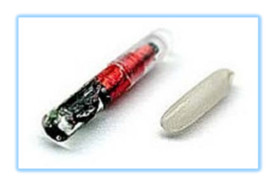
Microchip compared to a grain of rice