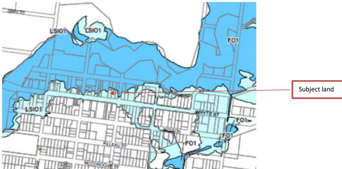
Figure 4 Revised extent of the Floodway Overlay and the Land Subject to Inundation Overlay

The submission raised legal, administrative and technical issues. All those matters were addressed in the officer report. The resolution from the meeting was to refer the submission to a Panel. The Panel's position on the submission is presented in chapter 3.