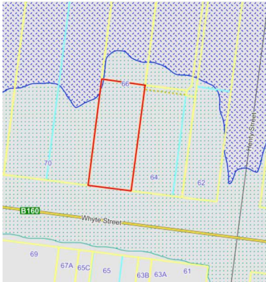
Figure 2 66 Whyte Street, Coleraine

Figure 3 shows the current situation in the Planning Scheme. The subject land is unaffected by either overlay.