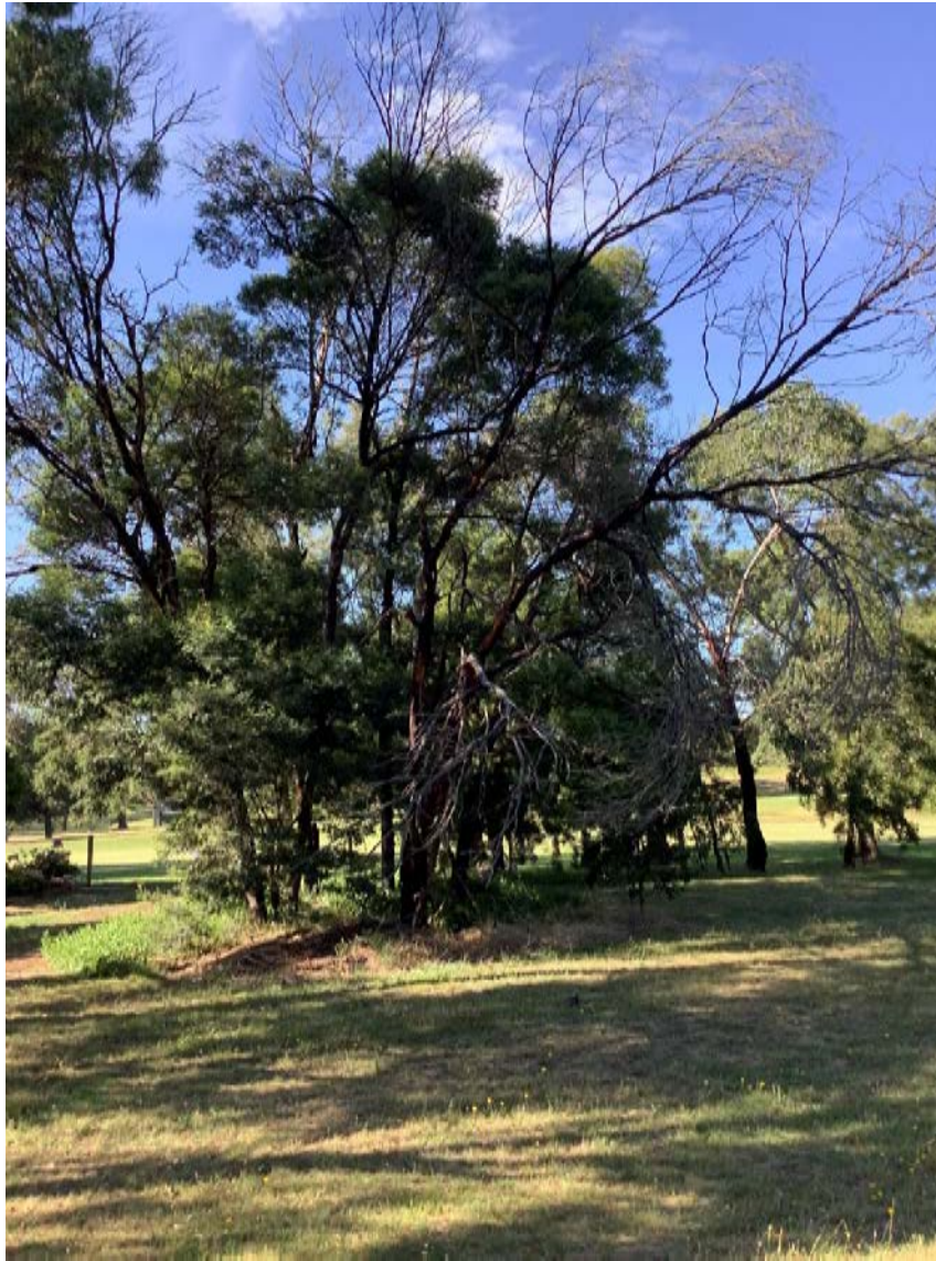
Above is group of trees numbered 2.

Several Acacia mearnsii , a couple are dead, most others are over mature and will soon die, these trees degrade quickly after dying and will fail frequently, the risk of failure is high but the risk of damage is much lower given they will not reach property and have a much lower occupation time around them by the public.