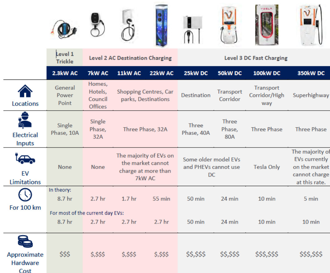
Fig. 2. Charging infrastructure options

The most appropriate role for local government in the transition to EVs is a matter that is not agreed upon.