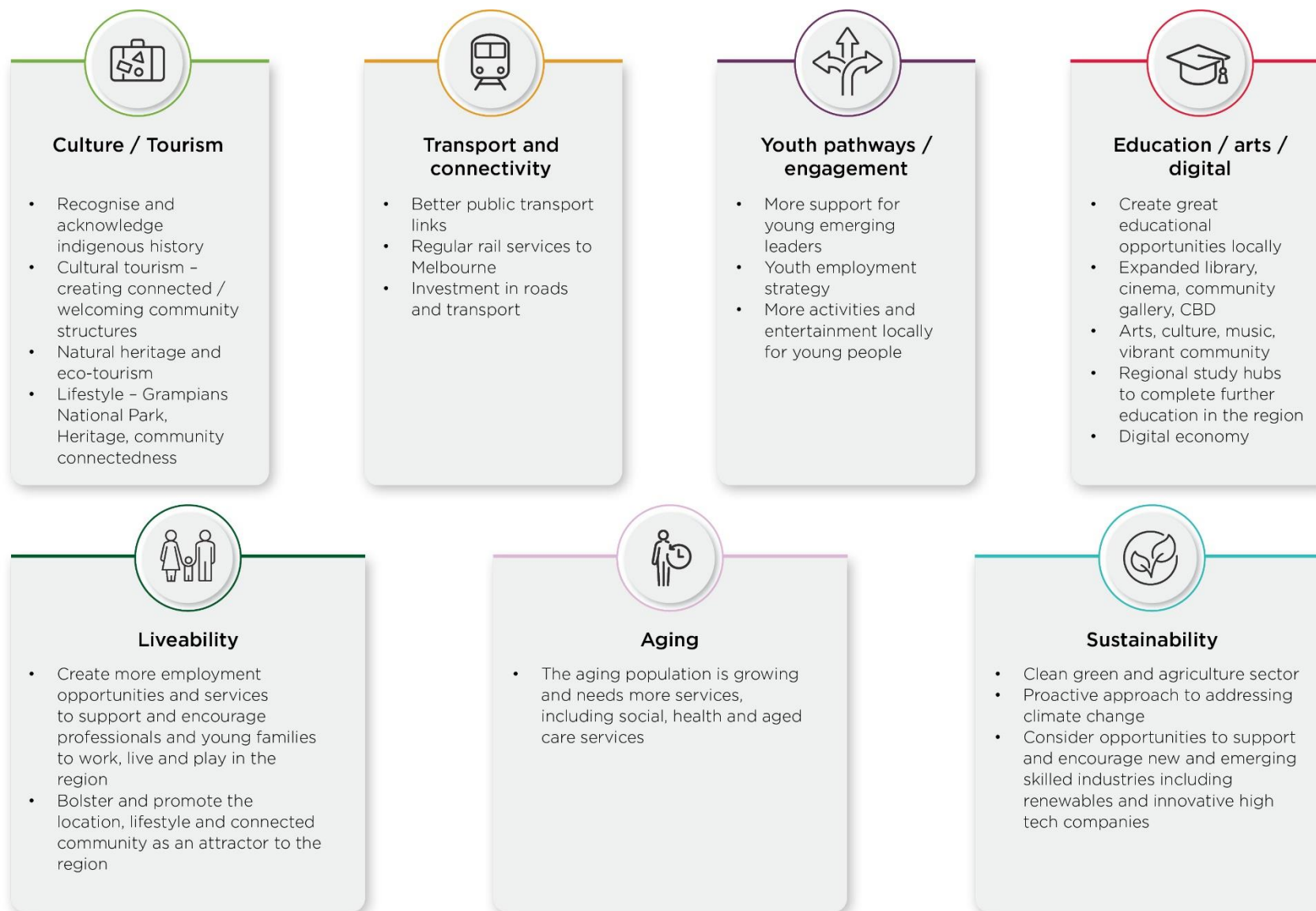
Figure 3: Identified opportunities