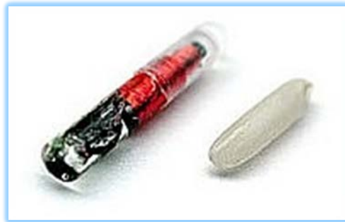
Microchip compared to a grain of rice