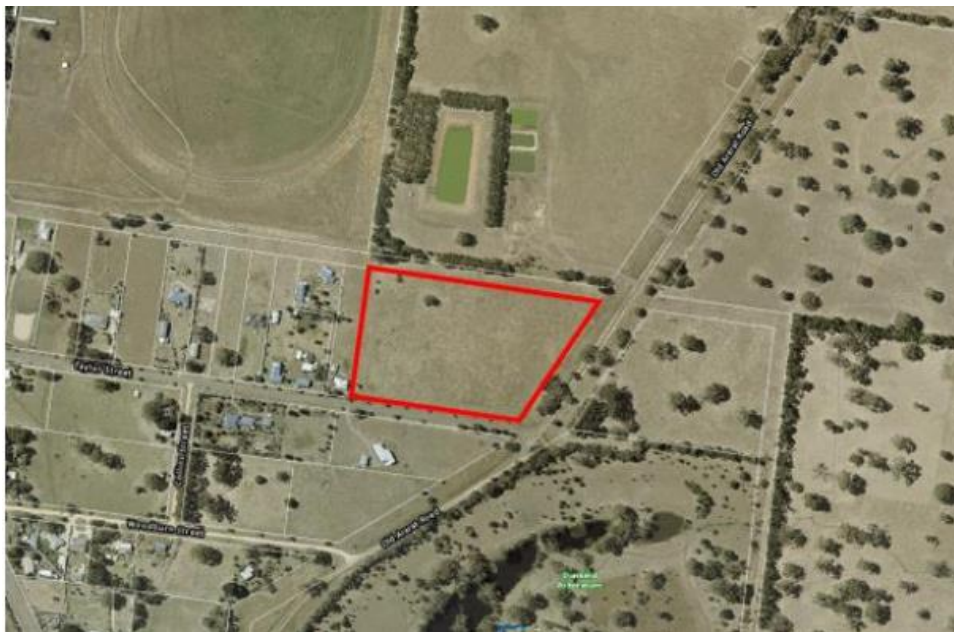
Aerial photo of subject land

The planning permit application proposes to allow, subject to conditions, a four (4) lot subdivision.