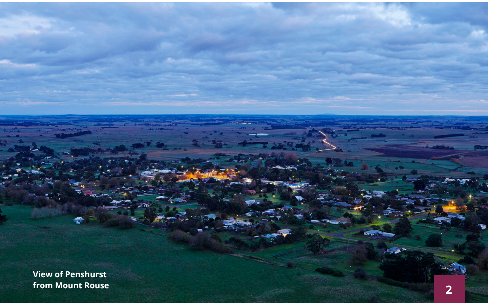
View of Penshurst from Mount Rouse