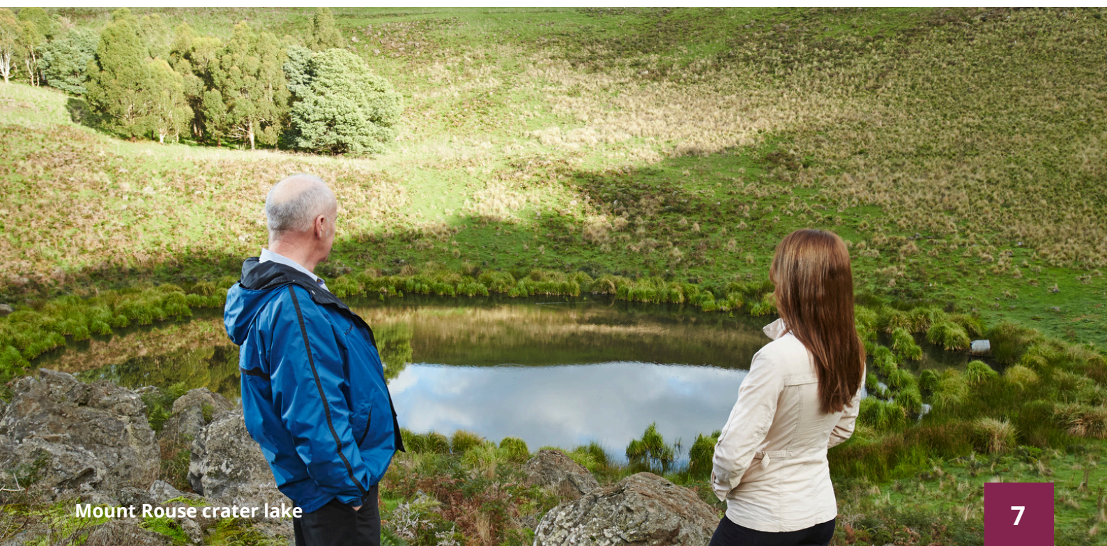
Mount Rouse crater lake