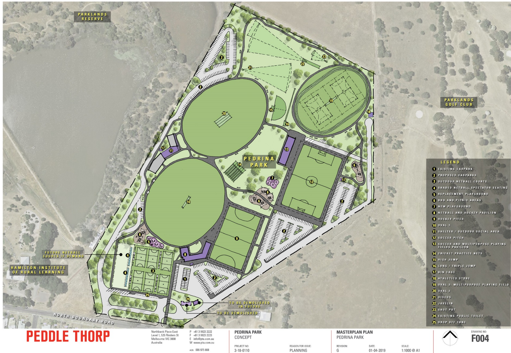
Figure 4 Pedrina Park Masterplan