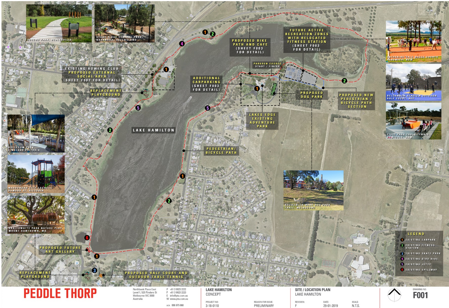
Figure 1 Lake Hamilton Masterplan