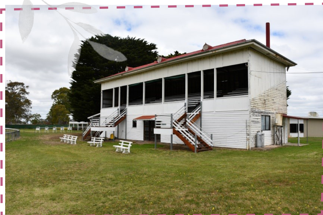
Coleraine Racecourse Stand