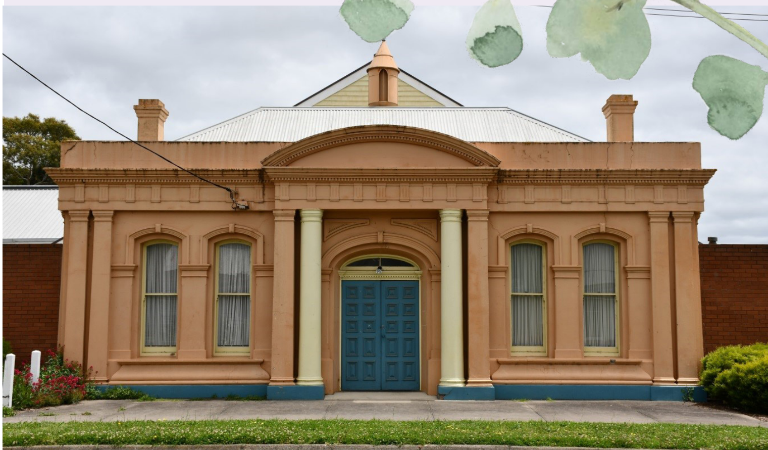
Coleraine Mechanic's Institute

The importance of conserving, supporting and promoting cultural heritage is variously outlined in Council's Arts and Cultural Strategic Plan , Sustainability Strategy and Tourism Strategy . These plans include objectives to further develop heritage tourism, conserve natural environments and support cultural practices and traditions.