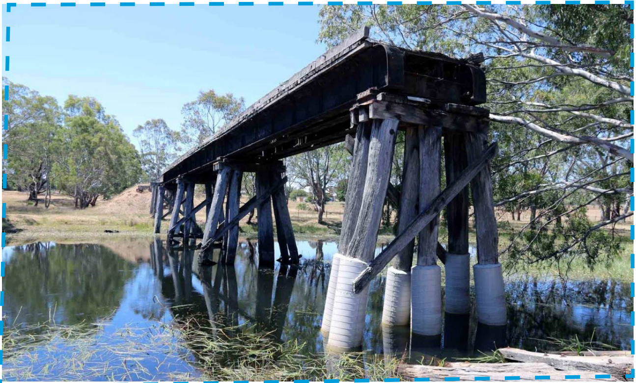
Cavendish Railway Bridge