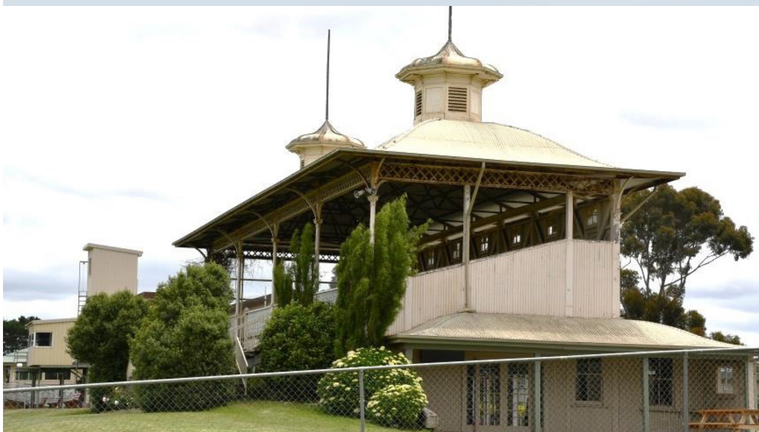
Hamilton Racecourse Stand