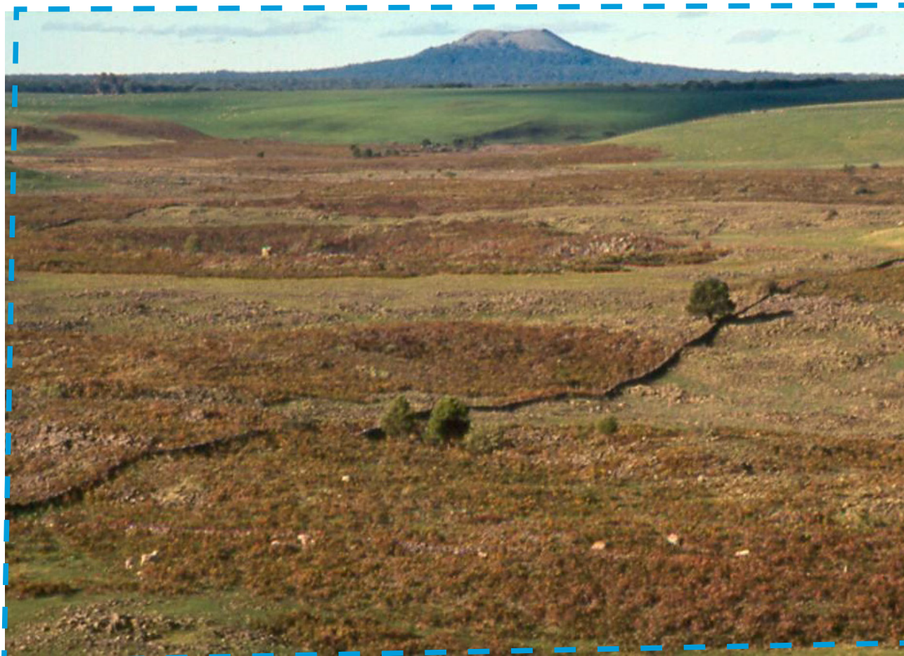
Harman's Valley Lava Flow