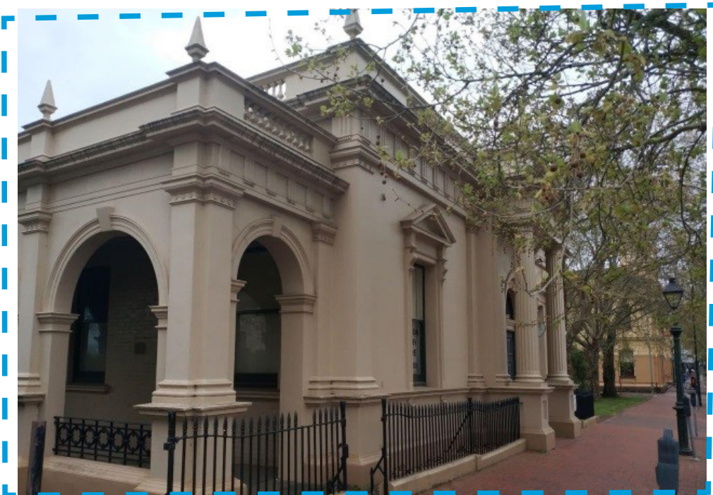
Hamilton History Centre

The Heritage Advisor and Planning Officers are well placed to assist asset managers in managing heritage places and supporting positive conservation outcomes, through policy development, heritage advice and identifying funding opportunities.