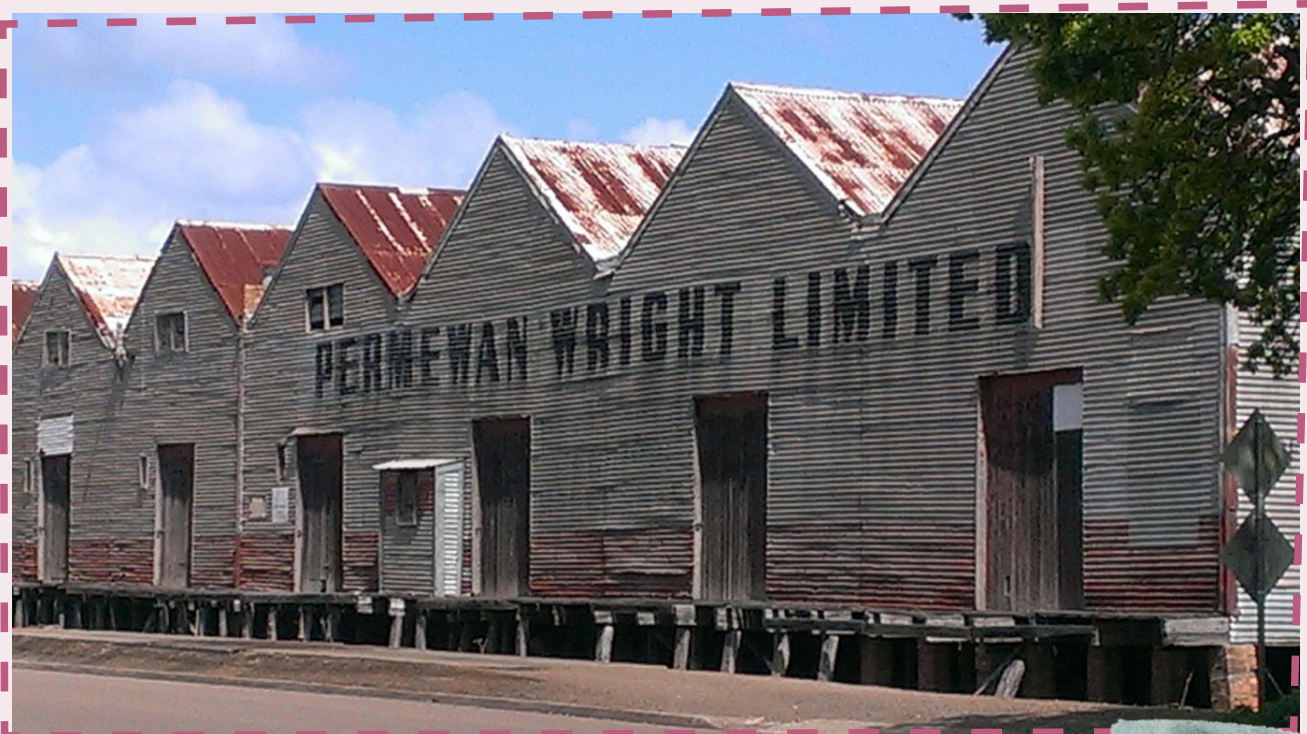
Permewan's Sheds Hamilton – demolished 2018