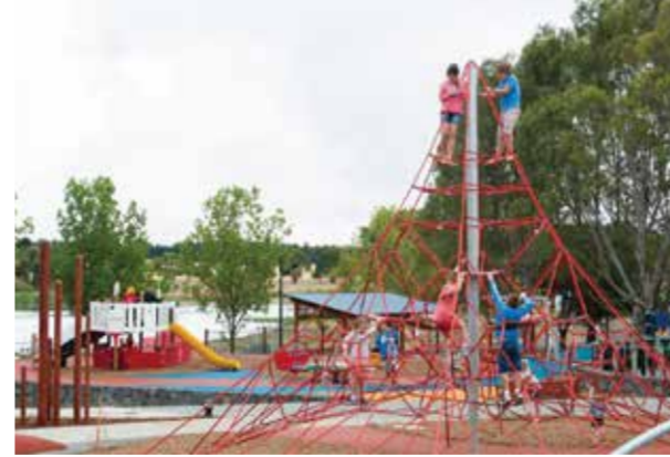
LAKES EDGE ADVENTURE PARK PLAYGROUND & DOG PARK (Map Ref I2) Located on the edge of Lake Hamilton, this all abilities playground has been designed and built for pure enjoyment. A great place to take a picnic or enjoy a barbeque and let the kids run wild!