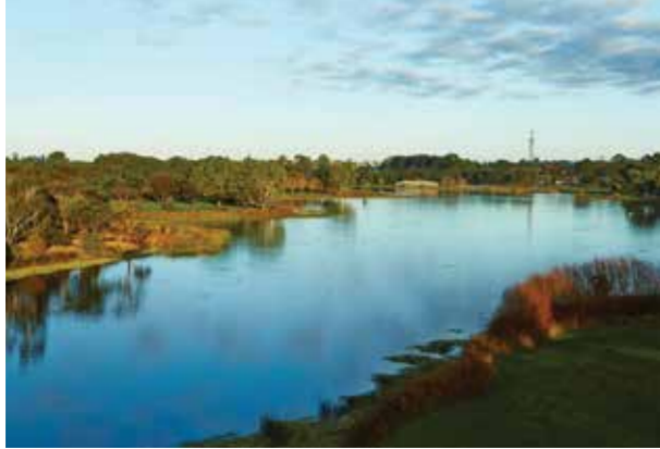
LAKE HAMILTON (Map Ref H2) An attractive landscaped manmade lake used for swimming, sailing, yachting, skiing, rowing and featuring an excellent walking/bike track of 4.5 km. Powered boats have lake usage on odd calendar days and non-powered boats on even calendar days.