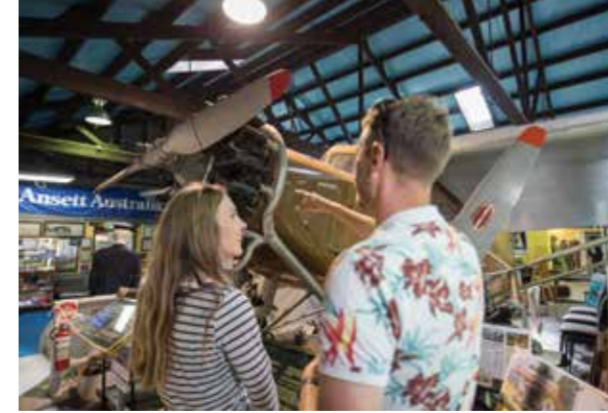
SIR REGINALD ANSETT TRANSPORT MUSEUM (Map Ref H4) Once home to Sir Reginald Ansett, Hamilton became the birthplace of Ansett Airlines. The museum tells the story of the Ansett Empire with displays of aviation memorabilia and early documents. The museum is open 7 days a week from 10am - 4pm.