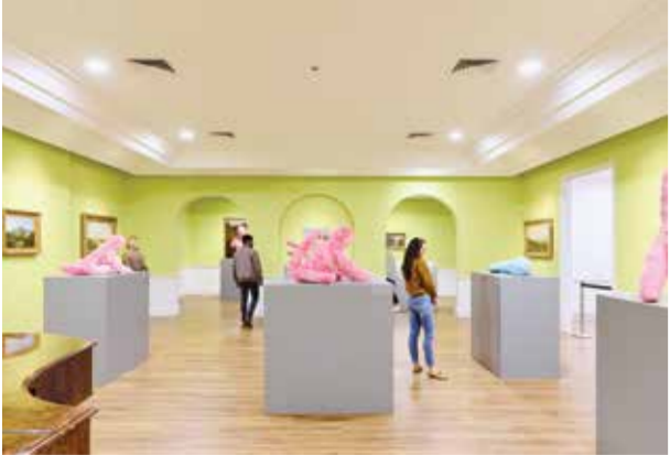
HAMILTON GALLERY (Map Ref F4) Outstanding free gallery presenting touring exhibitions, curated highlights from their internationally significant collection and engaging events alongside a design store.