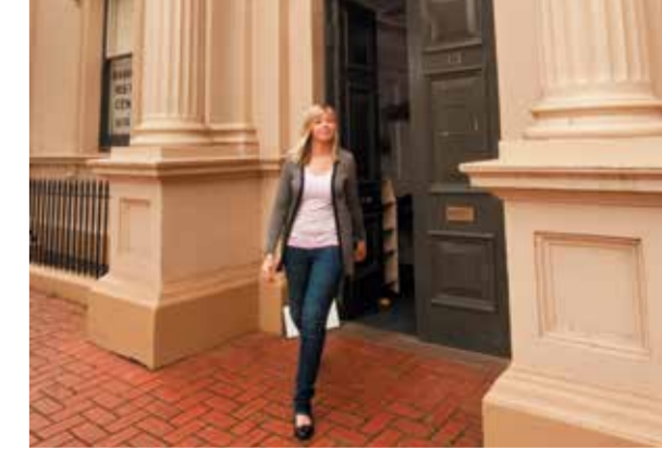
HAMILTON HISTORY CENTRE (Map Ref F4) Located in Gray Street, the centre is situated in a dignified, formal structured building designed by architect William Smith. Genealogy and history resource materials form the basis of the collection along with over 2000 local historical photographs, a small historical museum and a lace collection. Open every day from 2pm - 5pm except Saturday.