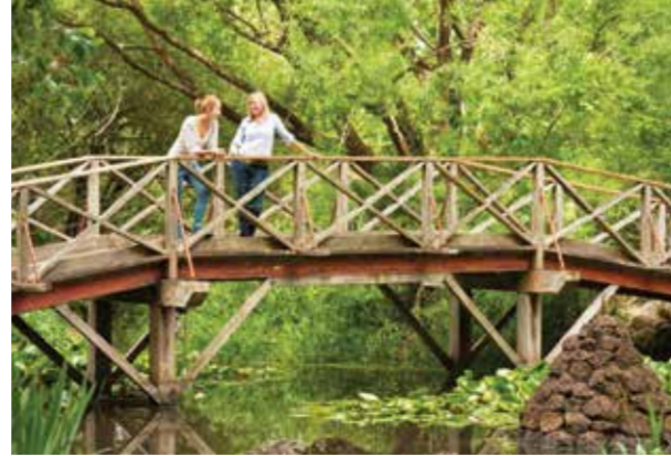
HAMILTON BOTANICAL GARDENS (Map Ref F5) One of Victoria's most outstanding regional civic gardens, the Hamilton Botanic Gardens are rightly recognised as an important part of Victoria's heritage. Designed in 1881 by Melbourne Botanic Gardens curator, William Guilfoyle, the Gardens are open every day and are a source of interest and pleasure to Hamilton residents and visitors alike.